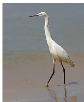
Figure 1: Little egret ( Egretta garzetta )

“ GeneMole® is a benchtop instrument for automated nucleic acid purification. Automation reduces the risk of injuries caused by repetitive pipetting, limits exposure to chemicals and infectious agents, and gives you more time to focus on other operations. GeneMole® can process 1-16 samples in one run and all the reagents required are available as pre-filled disposable MoleStrips™. ”